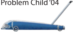
Problem Child '04

After teaming up with Fringe last year, Beta is reviving their own program. Attendance has been spotty at freerolls, but they've made up for it by rolling with other orgs for several days of practice. The team seems to have been put together at the last minute, and their absence on Sunday of Truck Weekend will keep everybody guessing about their push teams until race day.